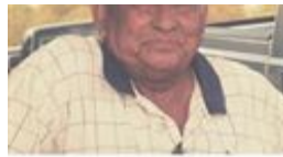
In loving memory of

“ 161 files added to the album Life Tributes